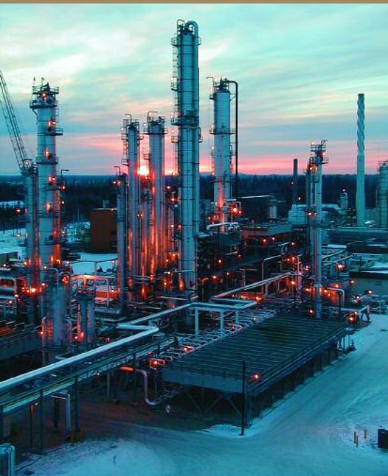
Process units at the newly acquired Flint Hills Resources North Pole refinery against the Alaskan sunset.